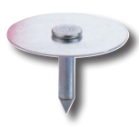
ECONO- POINT PINS