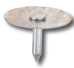
GOLD SEAL PINS