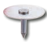
ECONO- POINT PINS