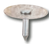
GOLD SEAL PINS

MACHINERY DIVISION © Duro Dyne Corp. Printed in USA 11/9/16 BC039405