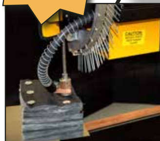
Wider mouth design for welding up to 4" duct liner with 4" weld pins