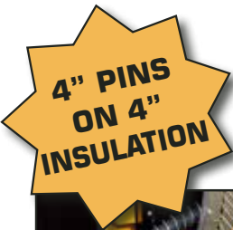
4" PINS ON 4" INSULATION