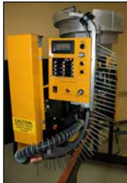
LED indicators for ease of function & serviceability

The FG Mach III Pinspotter was designed utilizing the best of current technologies to provide greater power and reliability for insulation fastening. The inherent minimal material handling and the use of welded pins will insure your shop a cost efficient, quality product. Our upgraded FG Mach III machine is capable of welding pins up to 4" to address the higher R-value insulation now being specified throughout the industry. Will weld the full range of Duro Dyne pins on galvanized metal up to 18 gauge.