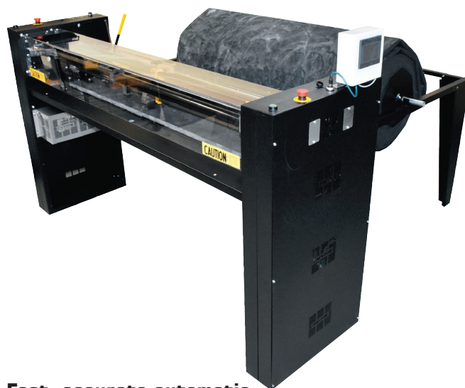
Fast, accurate automatic duct liner cutter.

Duro Dyne's experience with manual insulation cutters provides the technical know-how for producing a powered machine which will perform to the high standards required. Many PLSU3 insulation cutters are already providing contractors with efficient trouble free production in shops throughout the country.