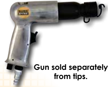
Gun sold separately from tips.

The Duro Air Gun (DAG) is sold without a tip and utilizes 90 PSI. Please see below for all four Innovative, patent pending* tips that are available and the capabilities they provide.