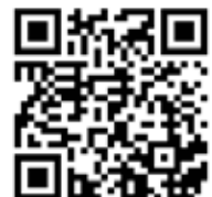
Scan to see demo of Air Tools

SEE REVERSE SIDE FOR ADDITIONAL AIR TOOLS.